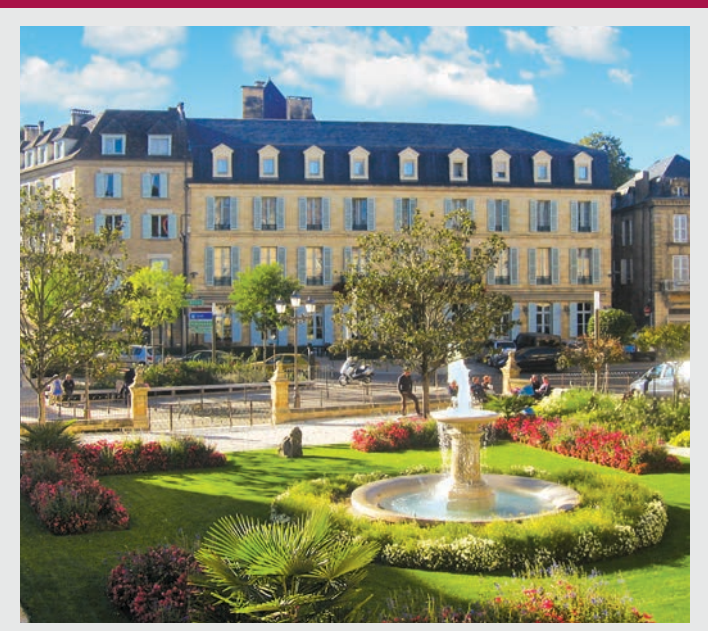
Exclusive hotels have been specially selected to enhance your experience in each fascinating destination we visit.

Bordeaux Hotel | Bordeaux Plaza Madeleine Hôtel | Sarlat-la-Canéda