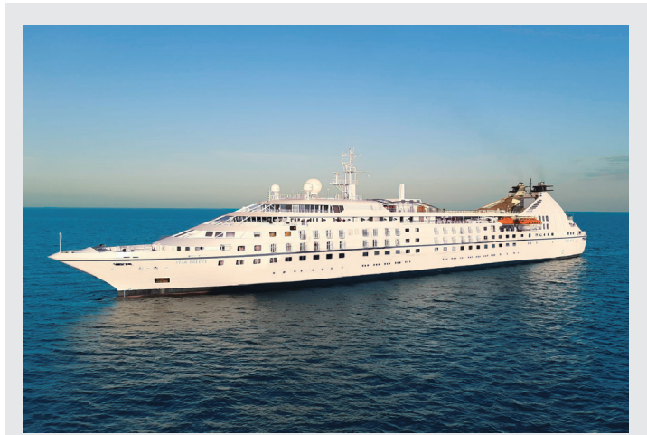
Star Breeze Exclusively Chartered Small Ship