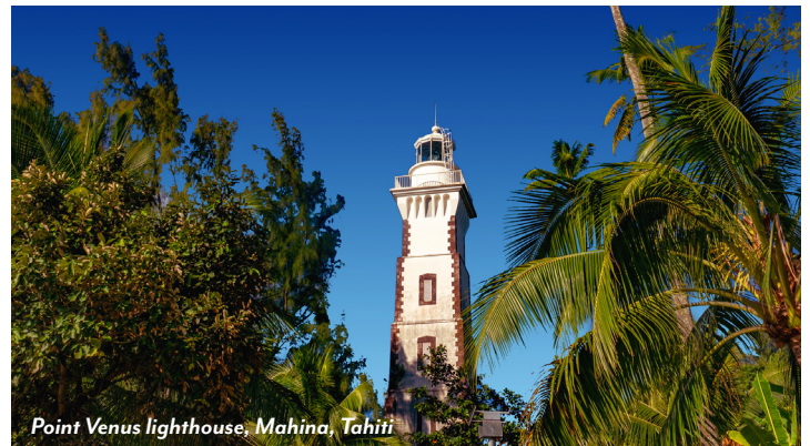
Point Venus lighthouse, Mahina, Tahiti