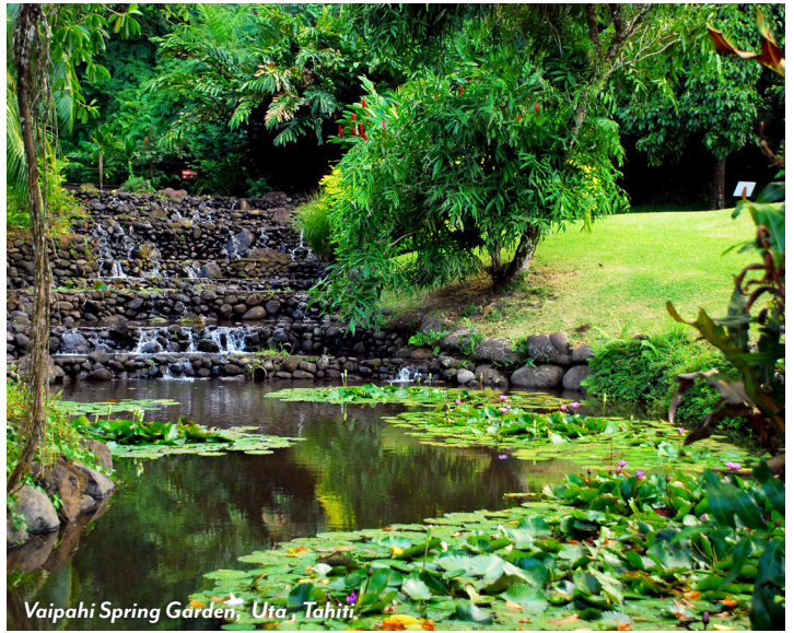
Vaipahi Spring Garden, Uta, Tahiti