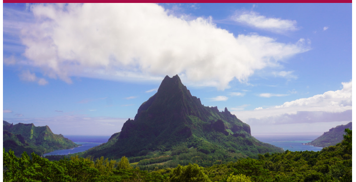
Mo'orea | 3 days, 2 nights East Coast Tahiti Tour | Free time in Mo'orea

Gohagan & Company 8550 West Bryn Mawr Avenue Chicago, Illinois 60631